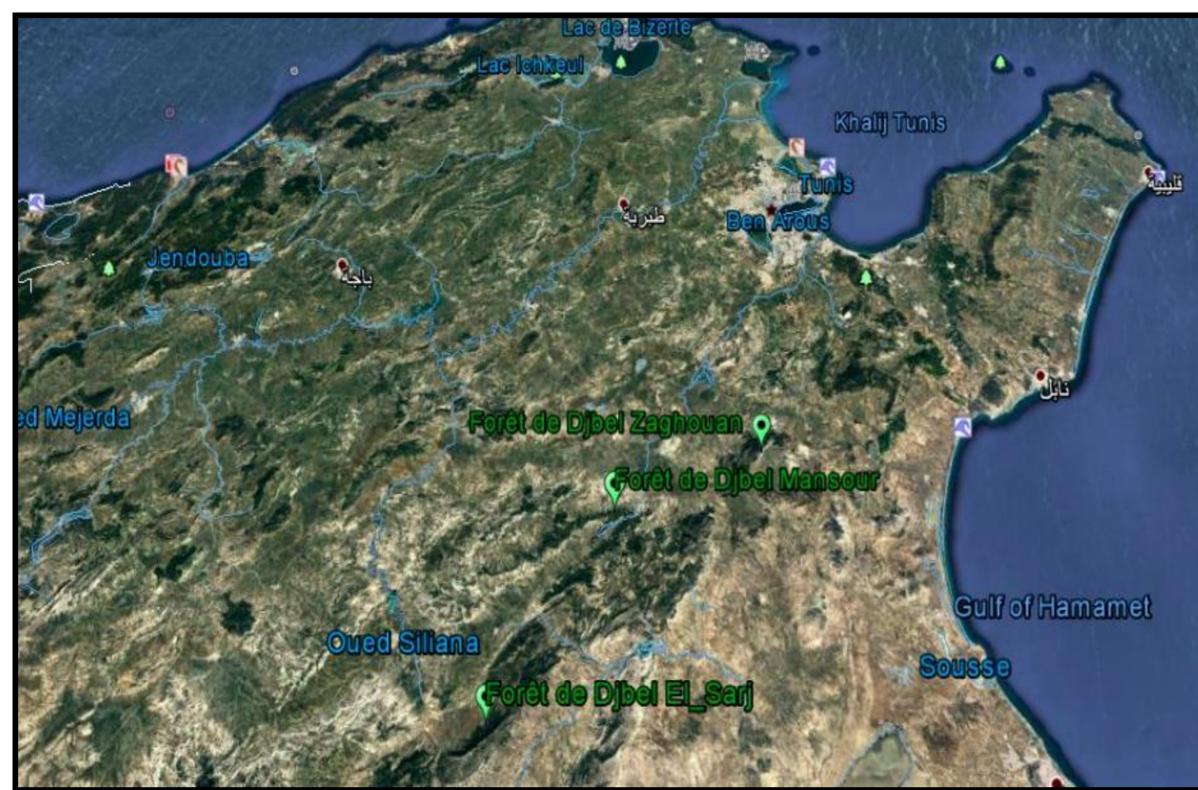
Table 1: Location of study plots by GPS within 3 sites

The experimental Sites were located in Northeast of Tunisia (Figure1). Geographical characteristics of sites is illustrated in Table 1.