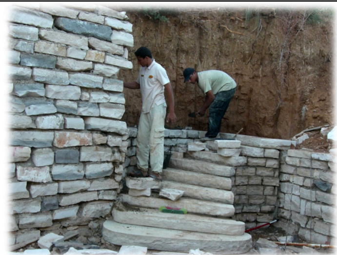
Valorization of local stone and marble quarries wastes for soil protection of the Sidi Amor site